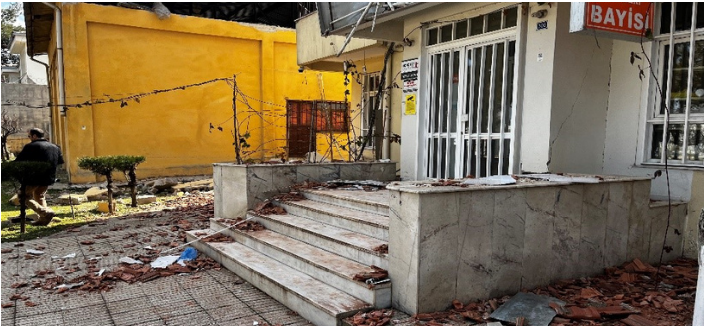
A Turkish financial cooperative, left devastated after the February 2023 earthquake.

Our efforts help the global credit union system stay resilient and millions of members get back on their feet.