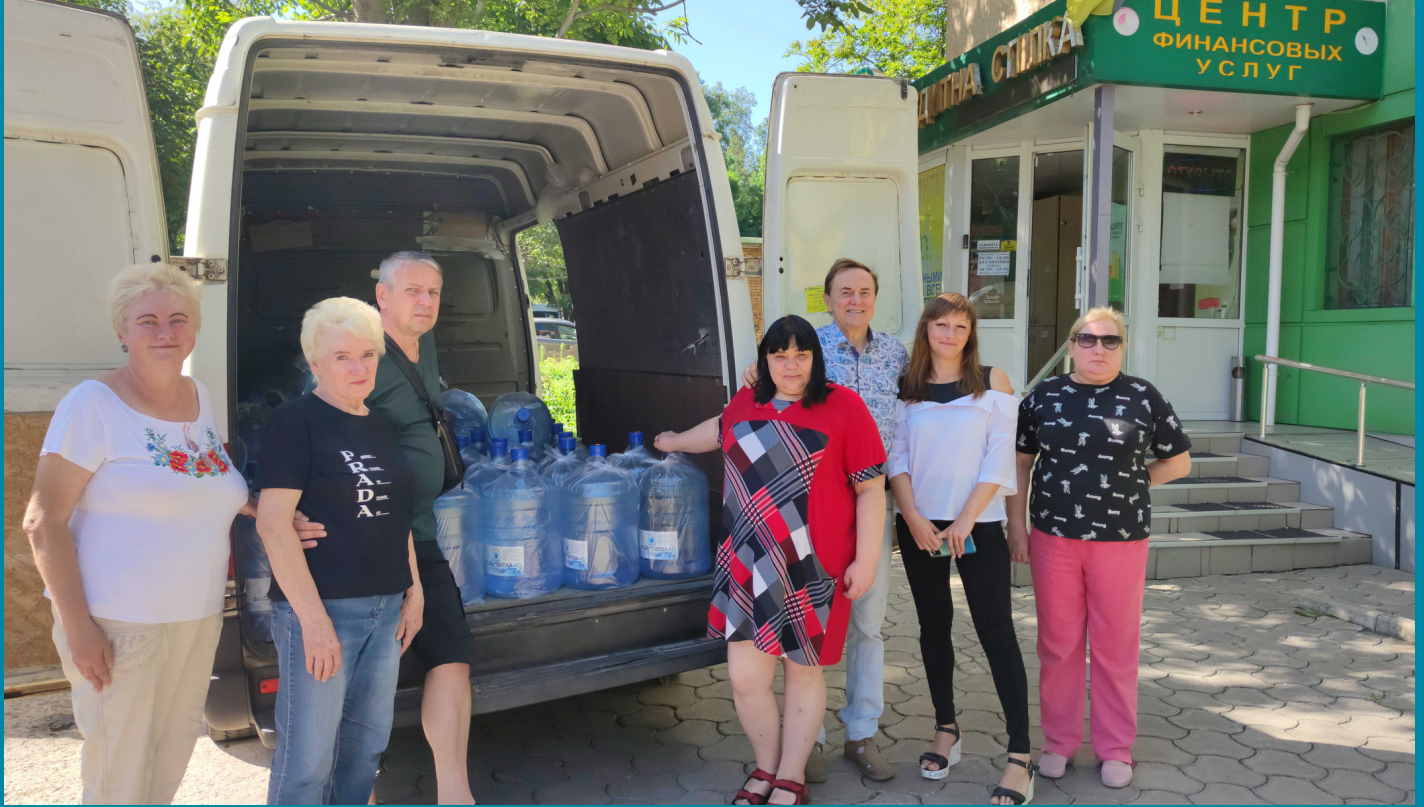
Credit union employees in the war-affected region of Ukraine, receiving drinking water thanks to a WFCU grant.