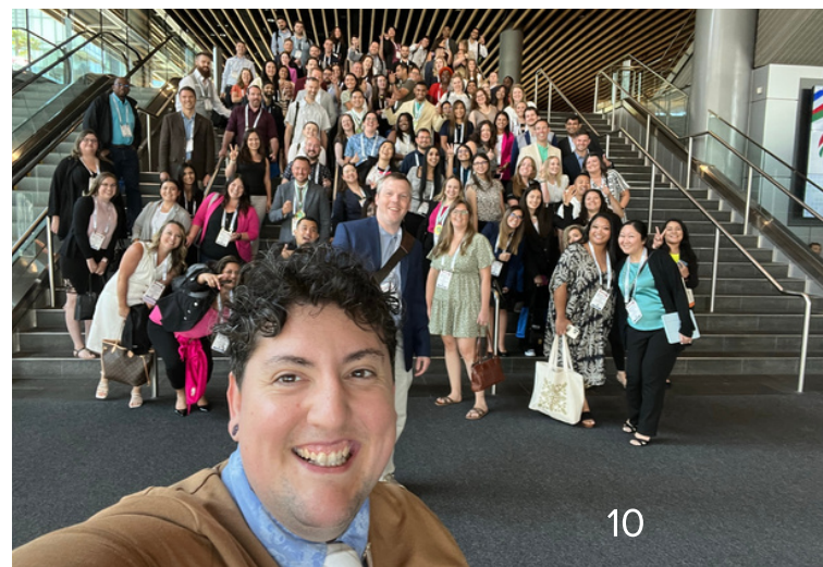
WYCUP members at the first ever in-person WYCUP summit, Vancouver, 2023.

The establishment of the Affiliates Council also broadened our capabilities to connect with leaders of young professional networks across the globe, bringing them together to discuss industry trends and promote the WYCUP experience.