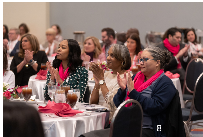
GWLN members at the GWLN Luncheon at GAC in 2023.

We also re-activated empowerment grants for scholars to implement projects aimed at growing financial inclusion, advancing social and community impact efforts, and uplifting their members and communities.