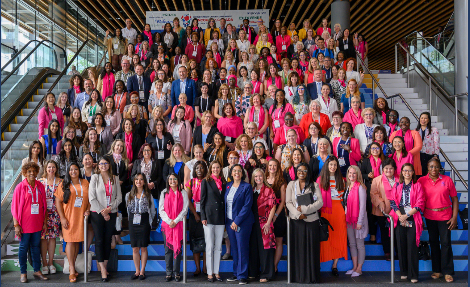
2023 GWLN Forum at WCUC